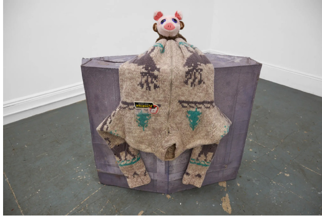
Liz Magor, Pembina , 2017. Textile, wool, polymerized gypsum, 41 ¼ × 37 ¼ × 22 ½ inches.

Cottage Industry By Reid Kurkerewicz JUNE 9, 2026