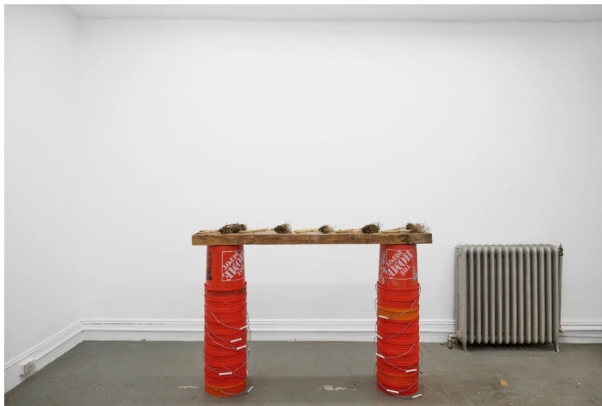
Emily Janowick, Final Resting Place , 2026. Plank, 20 buckets, corn, 48 × 65 ½ × 12 inches. Courtesy the artist and A.D. NYC.

Brooklyn-based painter Joseph Brock also blends surprising materials in his physically dense paintings. Kear and Noel (C.4) (2025–26) encases paper towels beneath layers of acrylic medium, a kind of paint without pigment. This makes the perfectly rectangular objects appear foregrounded, evoking the precision of buildings. Dotted patterns on the paper towel suggest constellations, a stitching pattern, a logo, or a child's first attempt at tracing letters. The dotted shapes are in the process of becoming communicative but stop short. The dots do not even appear on the same layer of the canvas, suggesting an editing process, where additions to the communication have been made at distinct times. Viewers at the opening craned their necks to inspect the mysterious painting more closely. The points of interest in Brock's other painting Kemble's Eyelets (C.4) (2026) are the edges of the canvas. The two simple crayon lines draw the viewer's eyes down to the bottom of the frame, where one can ruminate on the build-up of scrap cloth, acrylics, and gesso.